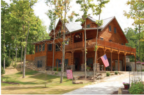
Perry's Stop #4

lake, this provided the perfect setting for our lunch break. Some enjoyed the peaceful setting while relaxing with a sack lunch while others tried their luck fishing in the lake. This is what log home living is all about!