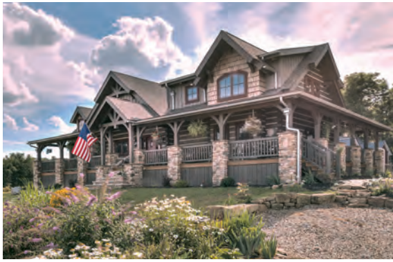
Young's Stop #5